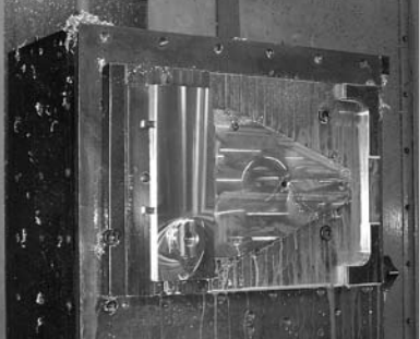
■ Final top surface machining