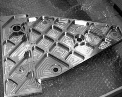
■ Finished rear surface. Differing wall thickness and pocket variations breaks up vibration