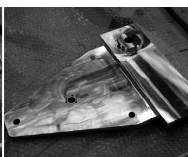
■ The Keel is diamond machined for the smoothest finish possible